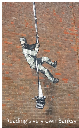
Reading's very own Banksy

Reading's museums will introduce you to a whole new world. Reading Museum boasts the only full-scale replica of the Bayeux Tapestry as well as the Huntley and Palmer Gallery; The MERL tells the story of food, farming and the countryside with interactive galleries, and has a lovely shop and delightful garden; the Ure Museum of Greek Archaeology has a unique collection of pottery while the Cole Museum of Zoology has just reopened in its new home on the University of Reading's Whiteknights campus.