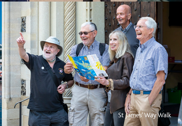
St James' Way Walk