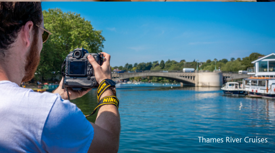
Thames River Cruises