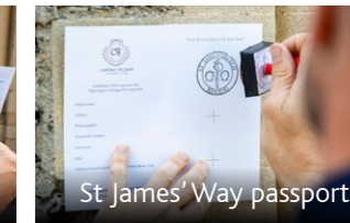
St James' Way passport