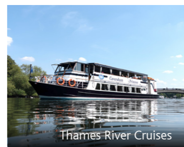
Thames River Cruises